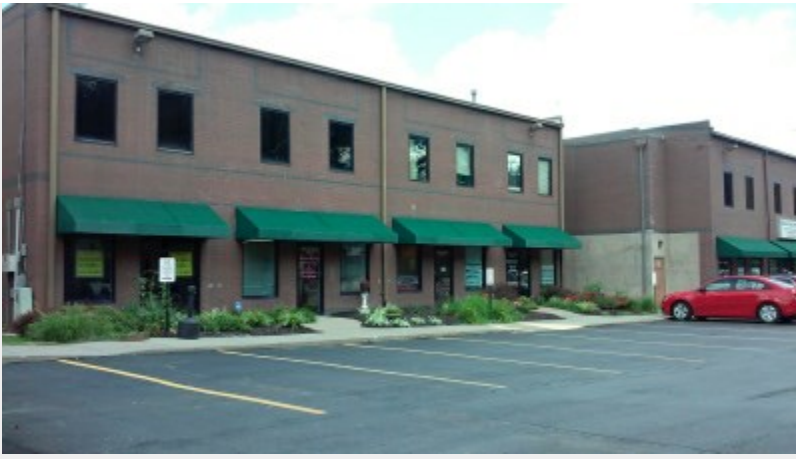
Park at you doorstep!